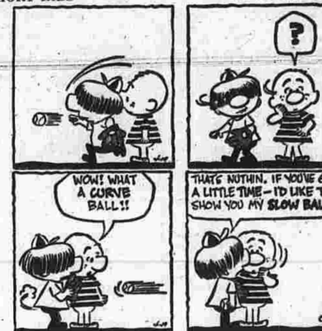
BY FRANK O'NEAL